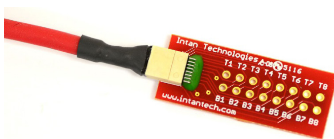
Figure 2. Stim SPI cable adapter board plugged into RHS2000 Stim SPI interface cable.

The signals on each Stim SPI cable adapter board are labeled T1 – T8 and B1 – B8. Note that the ‘T’ and ‘B’ pin names refer to the top and bottom row of pins on the connector attached to the adapter board. Due to the daisy chaining capability of these connectors, signals will alternate between ‘top’ and ‘bottom’ depending on how the adapter is connected to the system. The following table provides a quick reference to these signal locations: