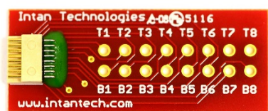
Figure 1. Stim SPI cable adapter board

Figures 1 and 2 below show the Stim SPI cable adapter board connected to an RHS2000 Stim SPI interface cable. The adapter board contains no active circuitry; it simply breaks out all 16 signals from an SPI interface cable to easily accessible gold-plated holes with a 0.1" pitch. Wires or other connectors may be soldered to these holes.